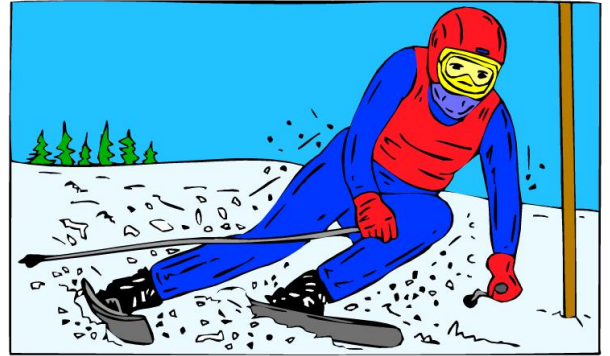
huá xuě 滑雪 skiing