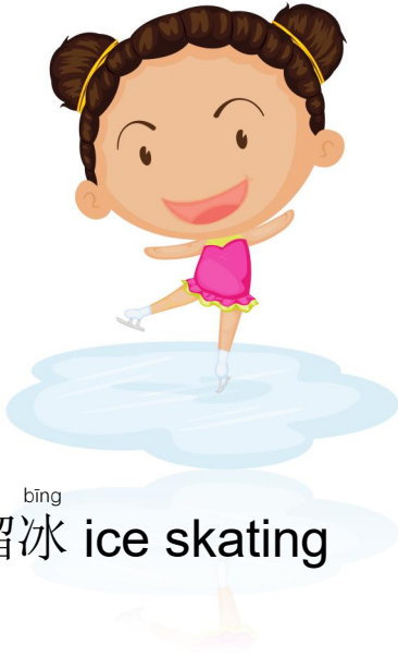
liū bīng 溜冰 ice skating