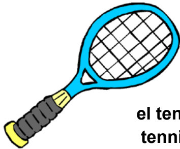
el tenis tennis