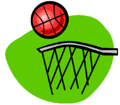
el baloncesto basketball