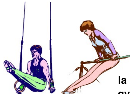
la gimnasia gymnastics