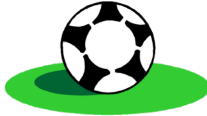
el fútbol soccer