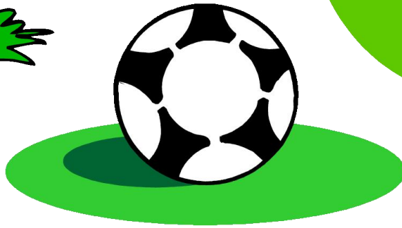
zú qiú 足球 soccer