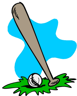
bàng qiú 棒球 baseball