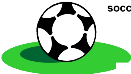
zú qiú 足球 soccer