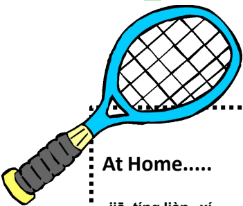
wǎng qiú 网球 tennis